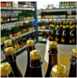
5 Inspiring Beer-Related