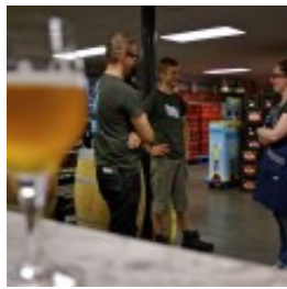
A Belgian Bottle Shop and its