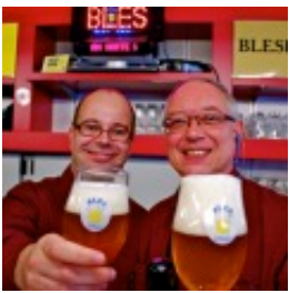
Brewing for a Beer Festival: