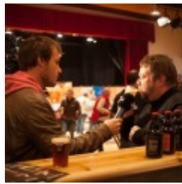
'Festibière' Belgian Beer